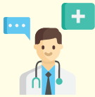
Consultations for Chronic Conditions

It can be used as payment for the following services: