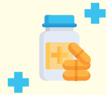
Medication for Chronic Conditions