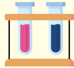
Laboratory Tests related to Chronic Conditions