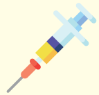
Child and Adult Vaccinations